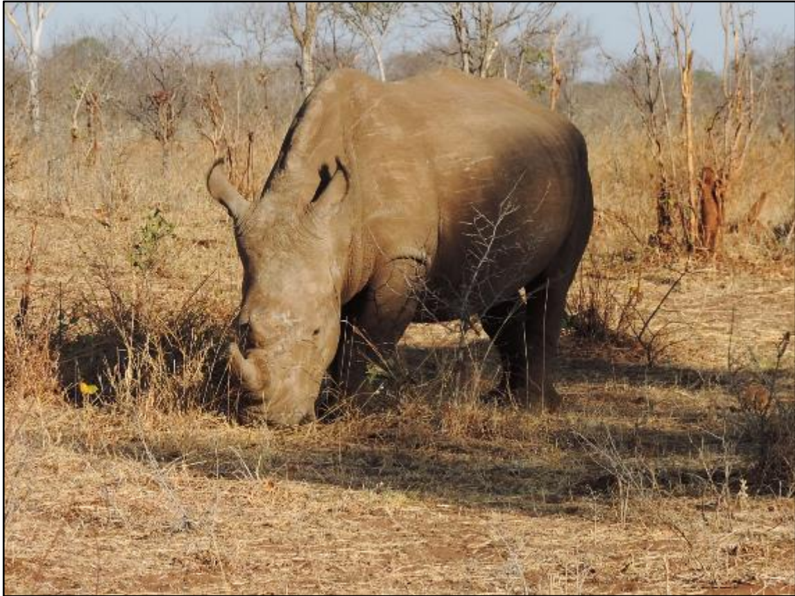
Square-lipped (or White) Rhinoceros