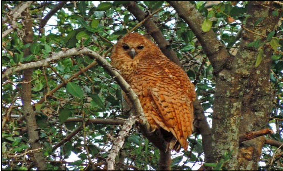
Pel's Fishing-Owl

Nxamaseri is located close to the Tsodilo Hills World Heritage Site—home to over 4,000 individual rock paintings dating back, in some cases, over three thousand years. Our lodge offers an optional half-day visit to this intriguing site and, depending on the level of interest in the group, individual participants or possibly the whole group may opt for this excursion. Note: In cases where only part of the group is interested in making this excursion, the leader will remain with the majority.