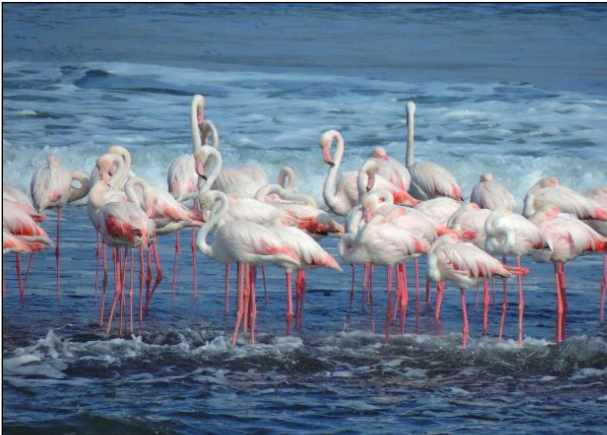
Greater Flamingos at Walvis Bay

August 10-11, Days 3-4: Swakopmund and Walvis Bay. We have two full days to bird the local area including Walvis Bay, the Kuiseb Delta, the two large salt works located on the coast, and the gravel plains north of Swakopmund. Our targets will include endemic and near endemics such as Cape, Crowned and Bank cormorants; African Oystercatcher; Hartlaub's Gull; South African Shelduck; and Damara Tern. Large tern roosts are often found in the area and we will search these for rarities such as Royal Tern amongst the more numerous Common, Arctic and Black terns. We can also expect numbers of Greater and Lesser flamingos and Great White Pelicans, as well as a host of shorebirds. Our trip coincides with the arrival of