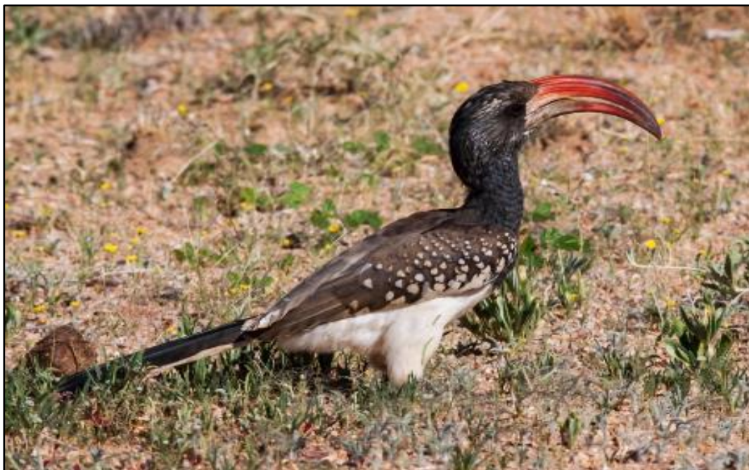
Monteiro's Hornbill

August 11-12, Days 1-2: Travel to Walvis Bay via Johannesburg. Participants will need to depart on overnight flights from various cities on August 11 and arrive in Johannesburg on August 12 in time to connect to a mid-morning commercial flight to Walvis Bay (flight details to be announced). Upon arrival and clearing customs, you'll be met by our local agent and transferred to Swakopmund to join the pre-tour group. The garden of our hotel offers Orange-River White-eye and White-backed Mousebird, both birds we won't see on the rest of the trip, while a short walk through the town to the coast offers the chance of seeing some of the coastal species like Crowned Cormorant, Hartlaub's and Kelp Gulls that we will also not see again on the rest of the tour.