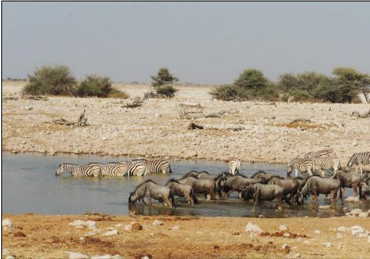
Common Zebra and Blue Wildebeest

The Okaukuejo area is drier than eastern parts of the park. Arid shortgrass plains border the pan, but most of the area is covered in acacia scrub. Southern Oryx (Gemsbok), Steinbok, Bat-eared Fox, and Yellow Mongoose are animals seen more frequently here, and the birds include Lappet-faced Vulture, Pale Chanting-Goshawk, Bateleur, Double-banded Sandgrouse (they drink at dusk at the camp waterhole), Double-banded Courser, Southern Yellow-billed Hornbill, various lark species, Kalahari Scrub-Robin, Barred Wren-Warbler, Chat Flycatcher, Red-headed Finch, and Yellow Canary. The immense, almost unbelievable nests of the Sociable Weaver can be seen in this area, and Shikras and Gabar Goshawks are often seen dashing through the hordes of seed-eating birds. Night-time viewing at the floodlit waterhole at the edge of camp is justifiably famous, and sightings of all the major mammals are possible.