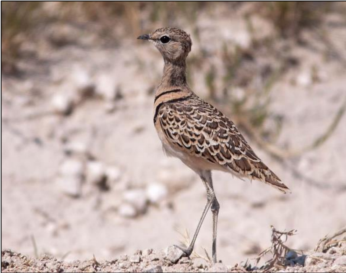
Double-banded Courser

NIGHT: Okaukuejo Camp, Etosha National Park